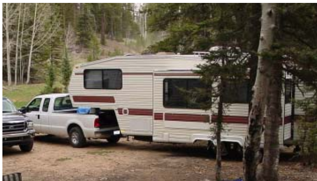
See attached picture that was taken in May of the unit near the North Rim of the Grand Canyon in a

1996 AutoMate 29' Mid Profile 5th wheel , rear kitchen, air ride suspension, 14' slide out, entertainment center, two batteries, two 7.5 propane tanks, two skylights, 10 ply tires, front electric jacks, A/C and furnace, four large holding tanks--extras and in great shape, $17,900 obo--805-964-9794 (2004 F-250 V10 low mileage tow vehicle also available for sale if needed).